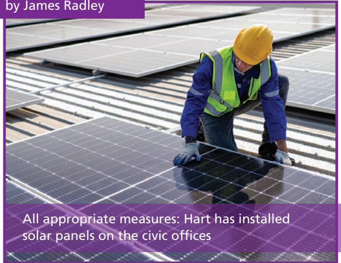
All appropriate measures: Hart has installed solar panels on the civic offices

charges in Fleet and shall continue to make grants to the Fleet Food Bank and Citizens Advice Bureau.